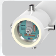
Four Side port

ALFA ≈ AEROSOL Pressure Vessels are the ideal solution for a wide range of applications including: