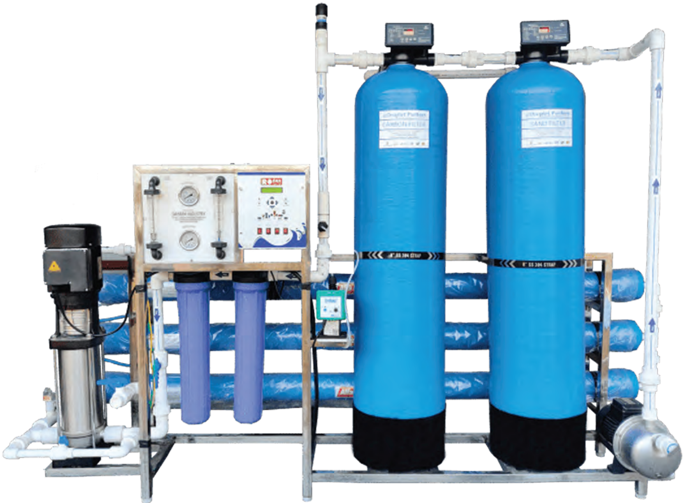
Industrial Water Treatment Plant

serve as a general framework for conducting a water audit: