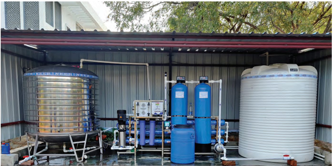
24 KLD Fully Automatic RO Water Treatment Plant

Water audit is an essential and effective tool for organizations dedicated to water conservation.